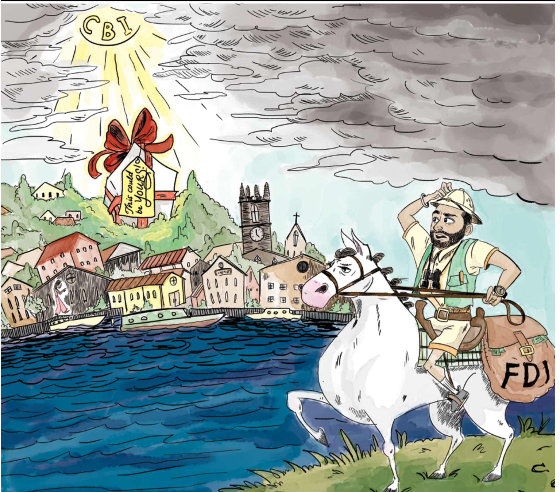
ILLUSTRATION: ASIA NOBLE