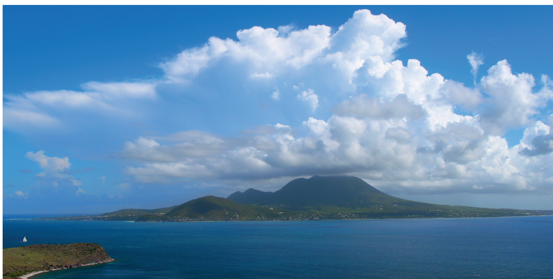
The banking capital of the Caribbean - Nevis island

THE FEDERATION OF ST KITTS AND NEVIS IS THE SMALLEST SOVEREIGN STATE IN THE AMERICAS, WITH A JOINT TOTAL OF ONLY 100 SQUARE MILES AND 50,000 INHABITANTS.